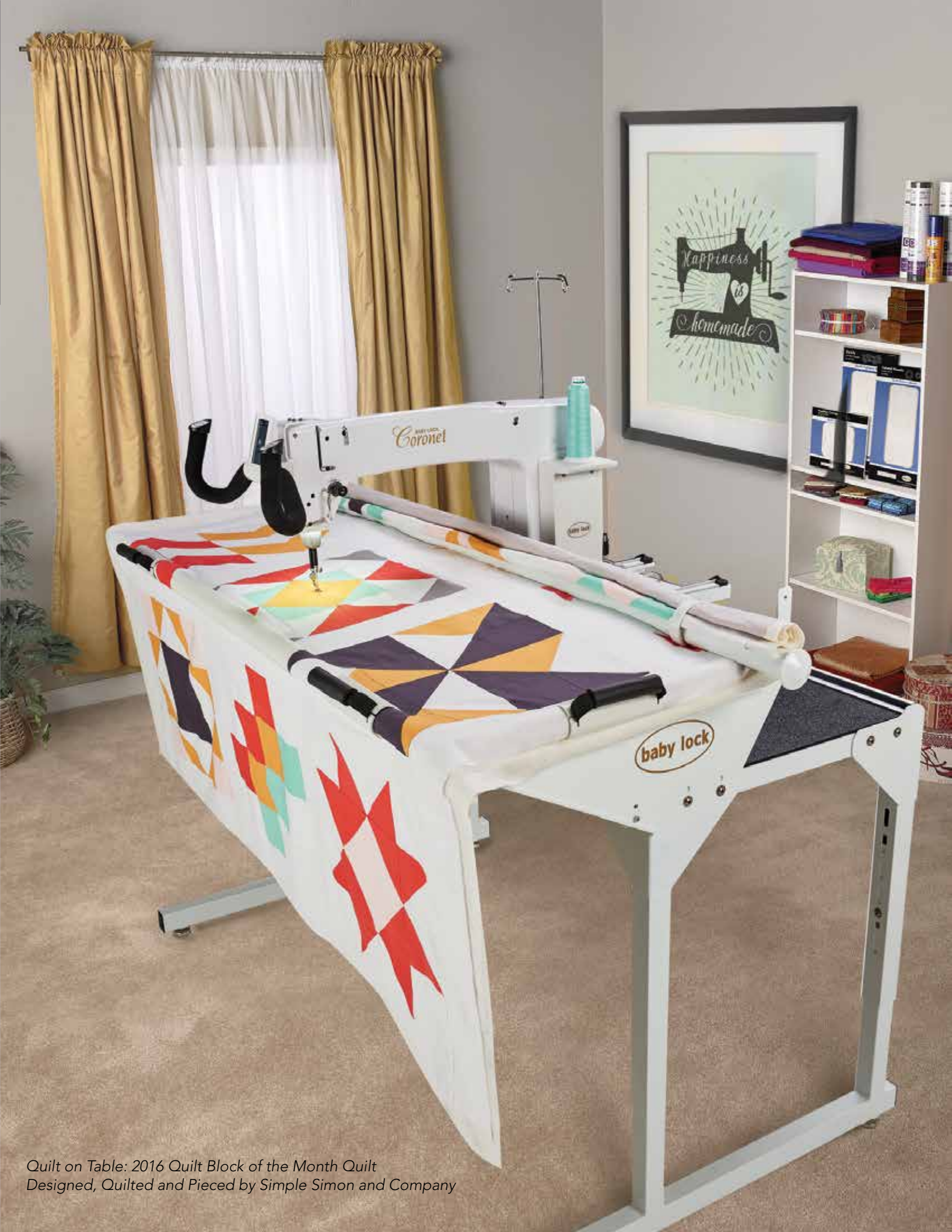
Quilt on Table: 2016 Quilt Block of the Month Quilt Designed, Quilted and Pieced by Simple Simon and Company